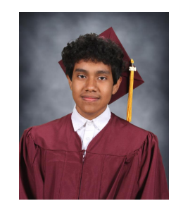
Manuel Morales Alemany High School