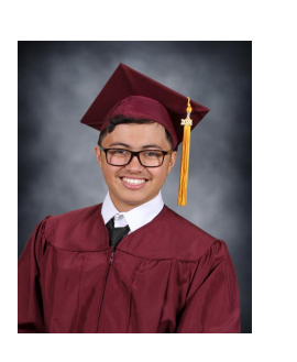
Abraham Domingo Alemany High School